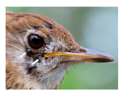
Figure 4. Veery, after-second year male, infested with three I. scapularis nymphs. One fully engorged nymph moulted to a male in 31 d. On 22 July 2019, this bird was moulting to prepare for the southward flight to its wintering range in Brazil.

One Veery was co-infested with H. leporispalustris (one nymph and one larva), and I. scapularis (two nymphs). Not only is there a breeding colony of I. scapularis present in this Laurentian River basin, an established population of H. leporispalustris is also there. Since these ixodid ticks were collected during the nesting and fledgling period, this bird parasitism denotes a cohabitation of two tick species in this sylvan locale, and signifies that these two tick species are sympatric. The Veery has trans-border and trans-equatorial migration during its northward spring flight, and has a breeding range in southern Canada, including southwestern Québec and northern United States; the wintering range is in central and southeastern Brazil (Figure 4). During the breeding, nesting, and fledgling period, Veeries have localized activity in juxtaposition to the stationary nest. When the young have fledged the nest, these passerines replenish their fat reserves, and prepare for the southbound trek to wintering ranges in southern latitudes during August and September. In late July, they typically moult in preparation for the southbound marathon flight.